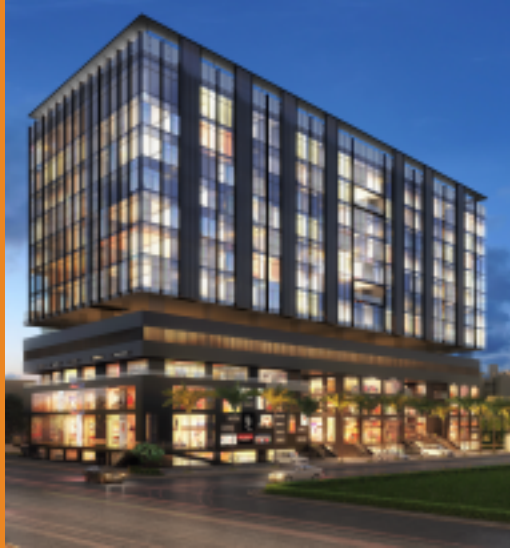
The Platinum Towers